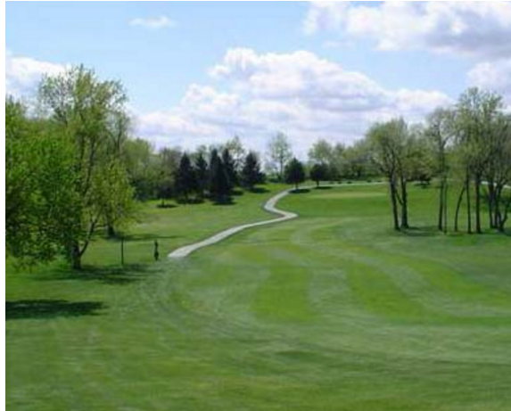
Minne Monesse Golf Course

THE 12-HOLE EXPERIMENT: That's what's going on at Rainside Golf Club in Gibson City, where the new owners bought two-thirds of the original layout because