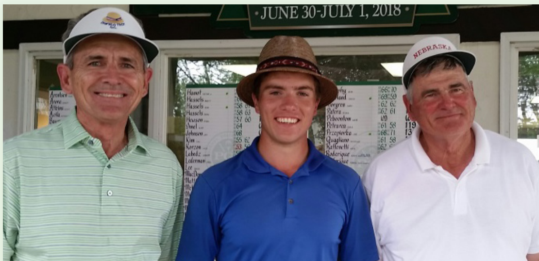
Zigfield Troy Par 3

Sean Curran of New Lenox and Jack Pagelow of DeKalb tied for third at 1-over 214 following a