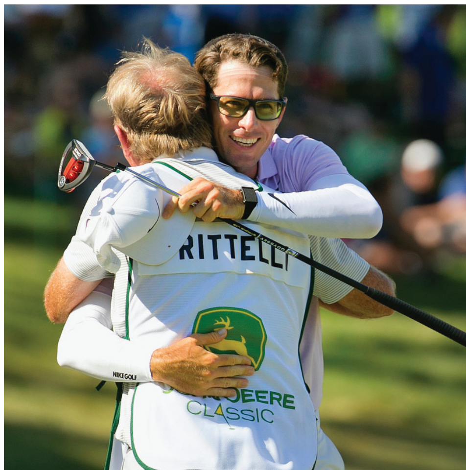
THRILL OF VICTORY Dylan Frittelli and his caddy celebrate victory in the John Deere Classic at TPC Deere Run.

He drilled it, and not even a so-so approach that barely made the front of the green, 46 feet from the traditional Sunday back-left pin placement, could fluster him en route to a 7-under 64 for 21-under 263. Hey, a three-putt par after driv-