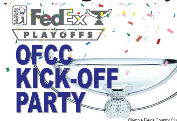
Olympia Fields Country Club

BMW received plenty of air time on NBC, the Western Golf Association brought in more and more ticket-holders once the public caught on to the quality of the field and what was at stake, and, especially when on the road, sold corporate suites by the bushel. That helped the WGA and its Evans Scholars Foundation reach its goal of having 1,000 caddie-scholars in college at the same time – and do so a year early.