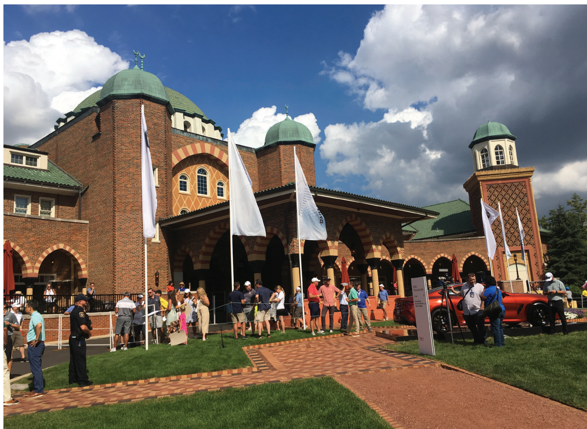
Tim Cronin / Illinois Golfer

It offers tremendous vistas. The view from the 13th and 17th tees over the creek flowing from Lake Kadijah and across to the greens and beyond are breathtaking.