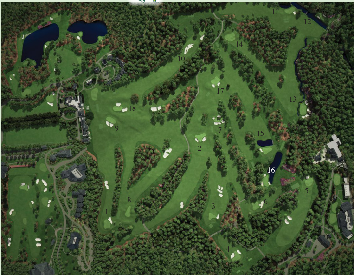
Augusta National Golf Club

Television: Thu-Fri ESPN 2-6:30 p.m. CT, CBS 10-35-10:50 p.m. CT • Sat CBS 2-6 p.m. CT • Sun CBS 1-6 p.m. CT • Radio: SiriusXM