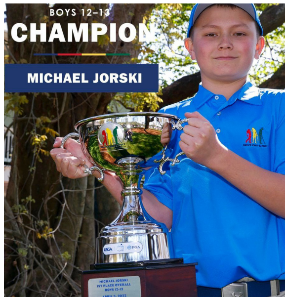
Drive Chip & Putt

Then he walked down to the front of the green and was faced with a difficult downhill putt with just a hair of break. After several deep breaths, he knocked it 18 inches short of the cup, again dead on line.