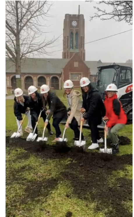
First Tee Greater Chicago (2)

GRAND PLAN The blueprint (left) for the First Tee's outdoor practice area and the groundbreaking (right).